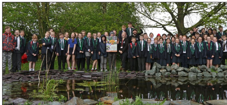
Bredon Hill Academy.